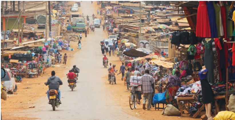
A road in Mukono, Uganda. Shortages of water and arable land can worsen existing ethnic and political tensions or cause old animosities to flare up.

Development cooperation has always been political to a certain extent, but it was further politicised in recent years as fragility became of greater interest to a broader spectrum of actors. This has come about due to the realisation that a stable and prosperous world is in everyone's interest – from economic, environmental, political, social and security perspectives – and thus all actors, at all levels of the international system must work together to make that vision a reality. If they do not, this current surge of crises and the existence of powerful threats call into question the future that people expect and that people deserve. 16 As Federal Chancellor Angela Merkel noted on the commemoration of the centenary to mark the end of World