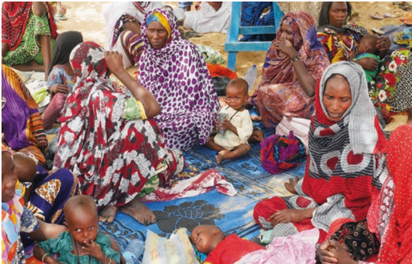
Internally displaced people in Bol, in Sahelian Chad located on the coast of Lake Chad. It is projected that by 2030 more than half of the people living in poverty will be found in countries affected by high levels of violence.

Fragility has already demonstrated, with worrying and convincing force, why it has the potential to be the single biggest spoiler to the ambitions behind not just the SDGs, but also to sustaining peace, efforts to adapt to climate change, as well as other key geopolitical priorities. Addressing it must therefore be a collective priority for the development, diplomatic as well as defence communities. Smarter approaches to engaging in contexts affected by fragility, including through foreign policy channels, could help ensure that investments in tackling fragility are maximised, and worth every cent.